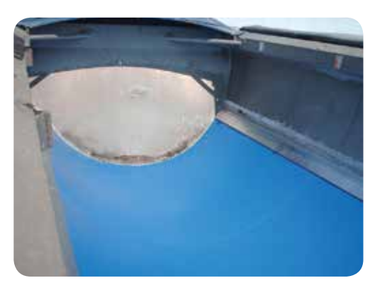
Whether you haul asphalt, rock, sludge, coal ash, mulch or sand, Dotmar has the right grade to suit your needs – affordably.

Matrox® Lining Systems and Ramex® Dumpliners from Dotmar Engineering Plastic Products provide affordable non-stick surfaces that stand up to the most extreme lining conditions. These products deliver a self-lubricating, impact-resistant polymer with mechanical properties that make them ideal for most lining applications. You'll appreciate how the low surface friction eliminates "load sticking" - providing an even load release every dump cycle, while reducing wash-out times. And our dumpliners will help protect your fleet from dangerous You can expect longer life from your brakes and hydraulics as well as vour bed when using а Ramex® liner.