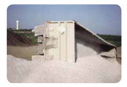
Matrox®/Ramex® liners reduce dump angles by as much as 40%. Lower dump stages reduce the chances of rollover accidents due to load hangup and reduce the chances of equipment striking overhead obstructions such as power lines or trees.