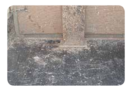
The Matrox®/ Ramex® bed liner is free of residual topsoil, resulting in more loads hauled per day.