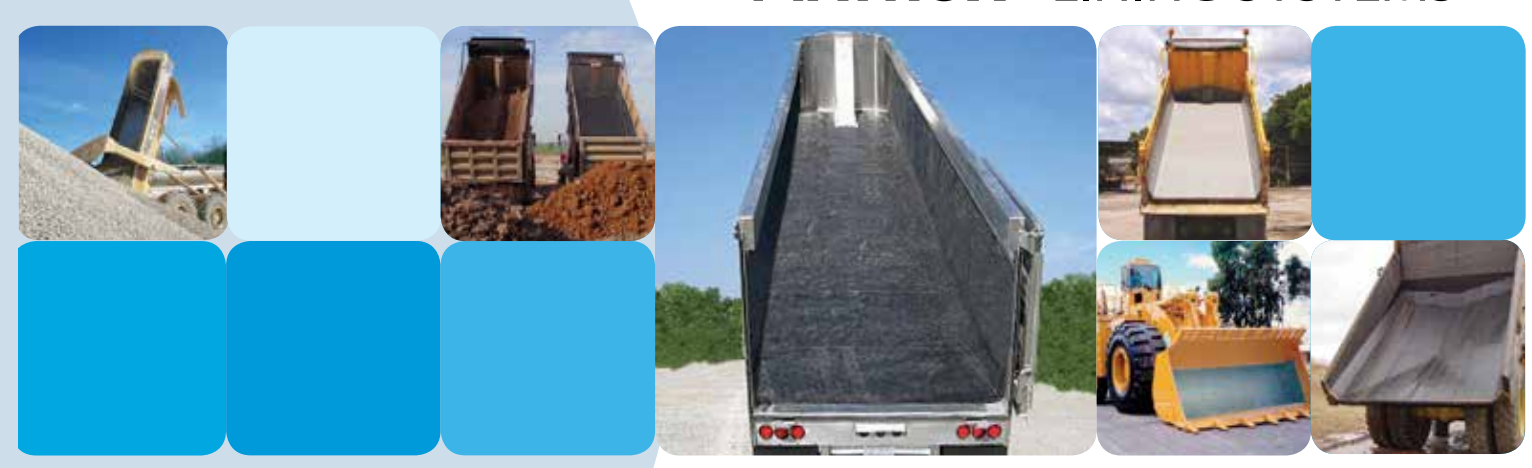
& RAMEX® DUMPLINERS